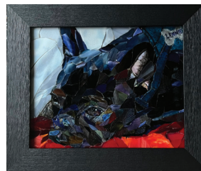
Honorable Mention ($50) Rande Pieper of Flushing Looks Are Deceiving Stained Glass Mosaic